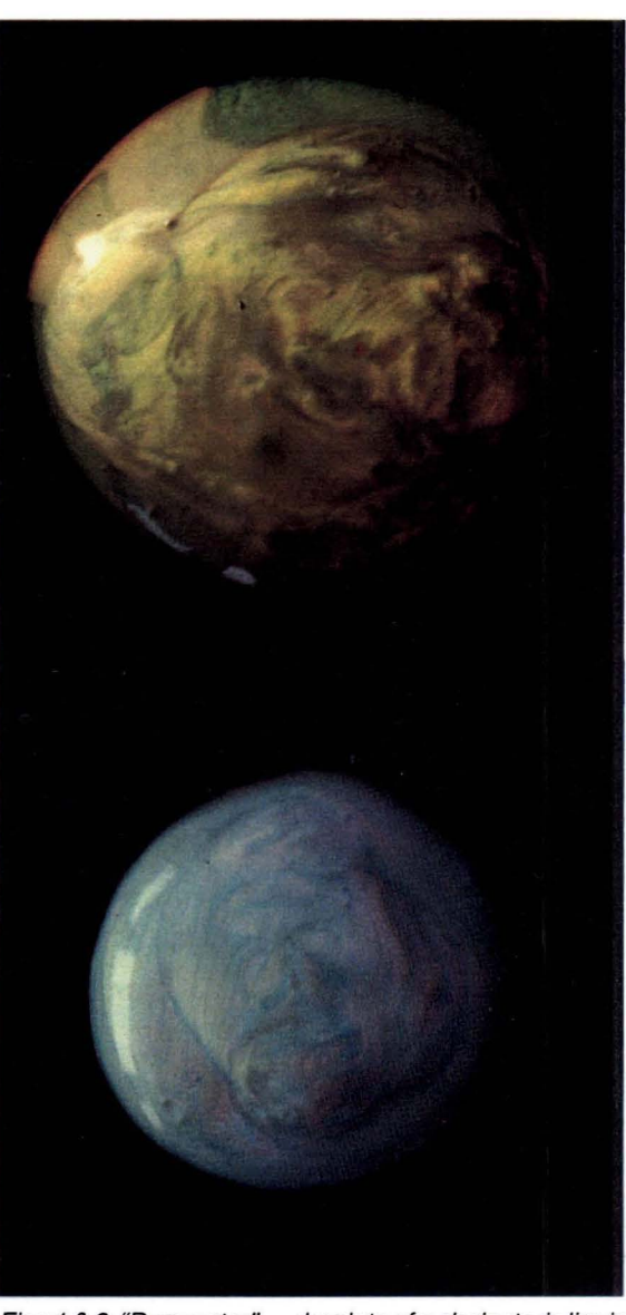
Figs 1 & 2: "Pym water" — droplets of a cholesteric liquid crystal showing reflection colour and distinct veins.

Marie Bonaparte, Poe's biographer and a well-known psychoanalyst, said: "It is not difficult to identify this water as blood" [5].